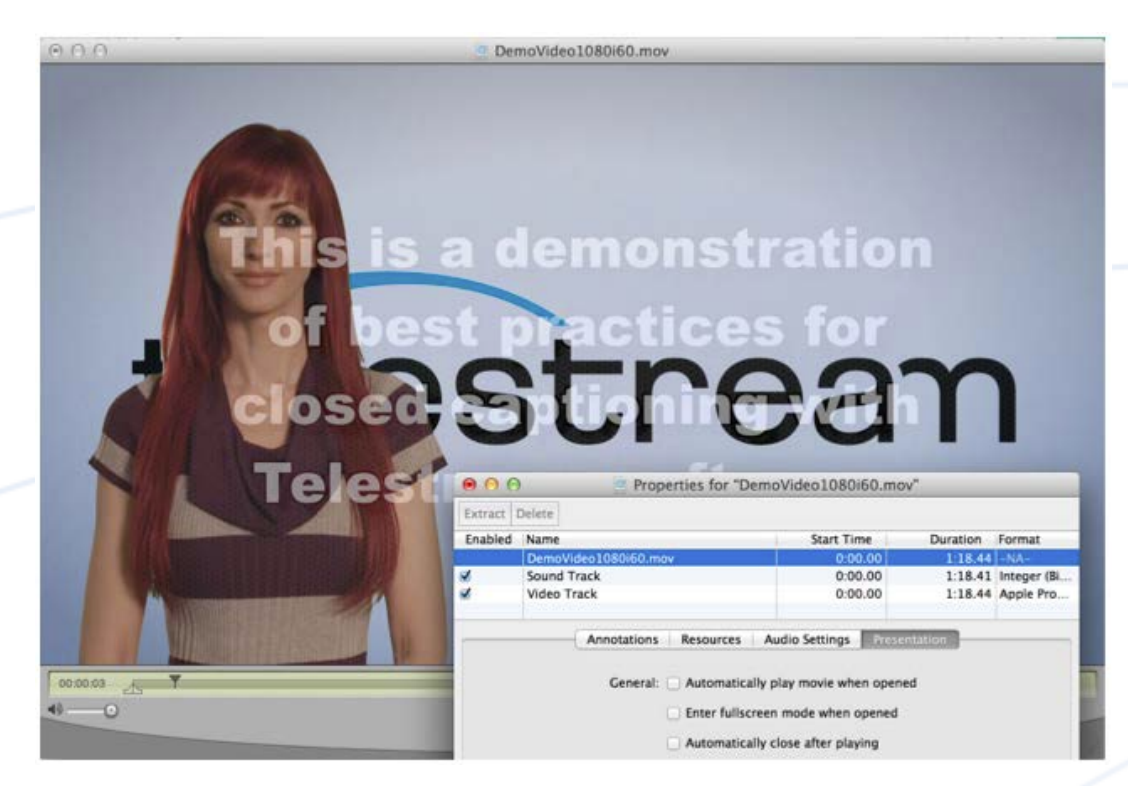
ProRes HD with Metadata