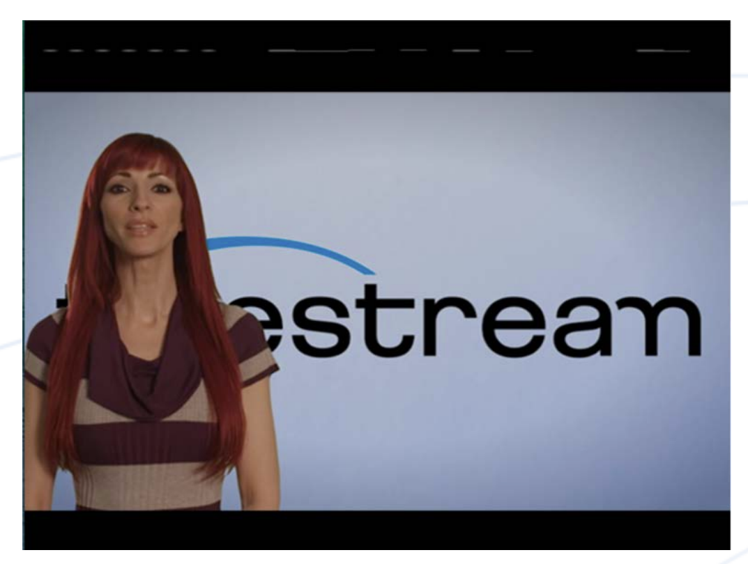
MXF OP1a SD IMX 30