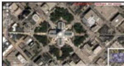
Figure 1. A typical Wikimapia place: the Wisconsin Capitol. Note the white box denoting the capitol as a place.

I even created places for two things you can’t see in the satellite photo: